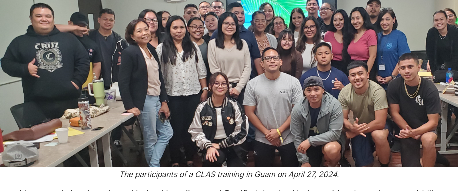
The participants of a CLAS training in Guam on April 27, 2024.

May was Asian American, Native Hawaiian, and Pacific Islander Heritage Month, and we would like to take the opportunity to celebrate Guam's efforts to promote health equity and CLAS. Guam is the largest and southernmost island in the Mariana Islands archipelago, located in the western North Pacific Ocean. It is a multicultural island with more than half of its 153,836 residents identifying as Pacific Islander (54%). Four in 10 residents (41%) identify as Chamorro. Over half (57%) of Guamanians speak a language other than English at home. [1]